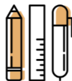
School Books & Supplies