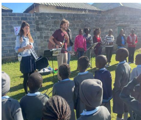
Music & Worship