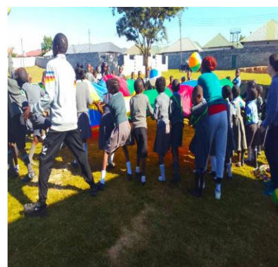
Games & Sports

TOGETHER , we ran a beautiful DISCIPLESHIP program under the theme: " LOVE ", based on Philippians 2:4 : "Each of you should look not only to your own interests, but also to the interests of others."