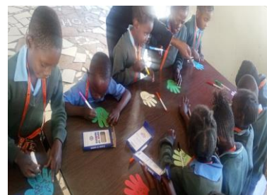
Creative Arts - Lesson

A Visit from the Legacy Team (USA): This month, we were blessed to receive a visiting team from our dear friends in the USA—The Legacy Team. They came not just as visitors but as brothers and sisters in Christ, joining hands with our teachers, chaplains, and interns to share God's love with our children for one week (June 26 th to June 30 th , 2025).