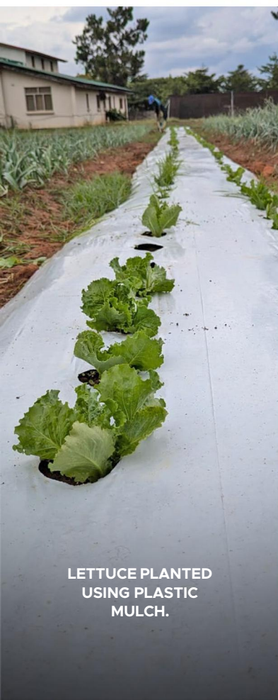
LETTUCE PLANTED USING PLASTIC MULCH.