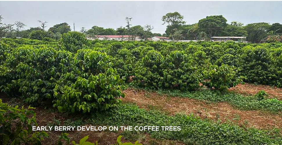
EARLY BERRY DEVELOP ON THE COFFEE TREES