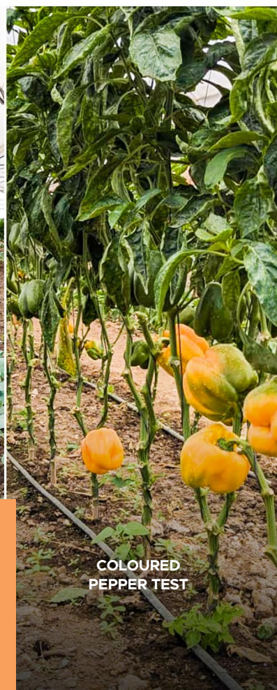
COLOURED PEPPER TEST