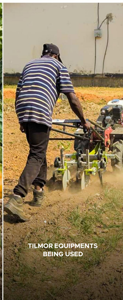
TILMOR EQUIPMENTS BEING USED