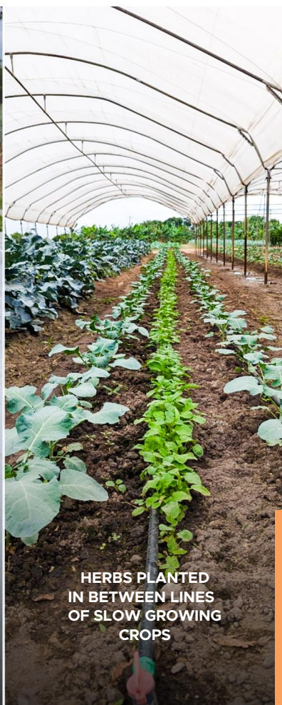
HERBS PLANTED IN BETWEEN LINES OF SLOW GROWING CROPS