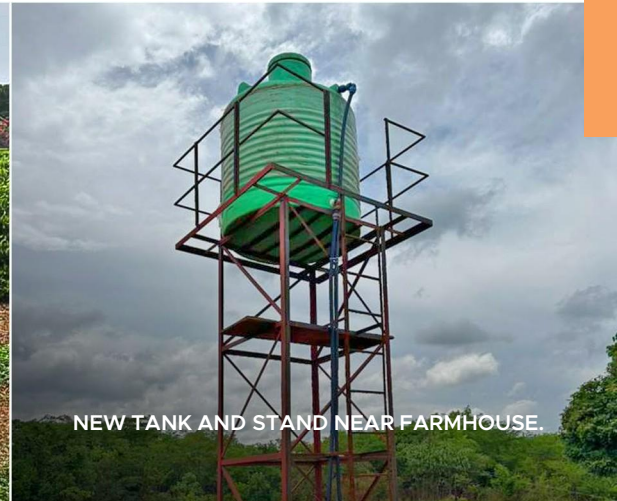
NEW TANK AND STAND NEAR FARMHOUSE.