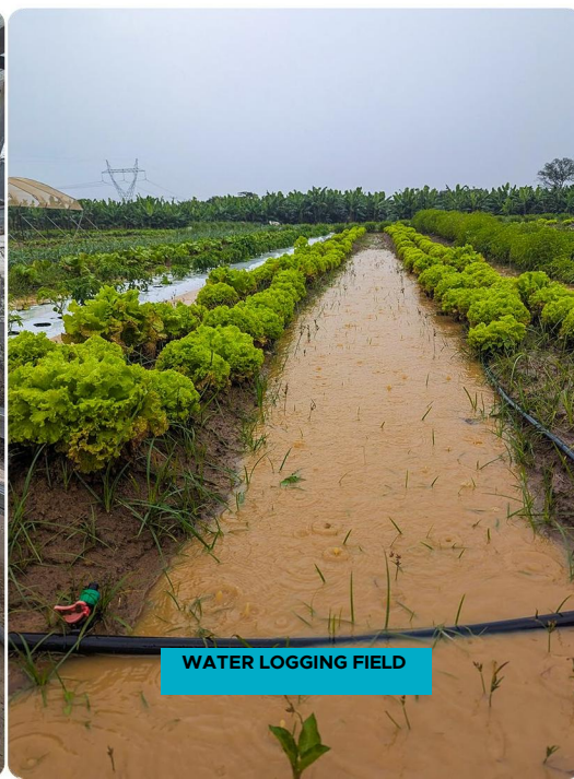
WATER LOGGING FIELD