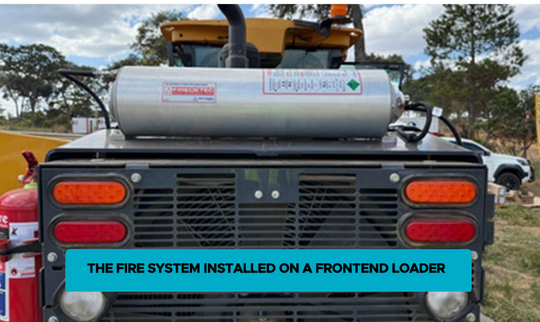
THE FIRE SYSTEM INSTALLED ON A FRONTEND LOADER

Ultimate Fire Suppression Systems provides advanced fire detection and suppression solutions, including sprinkler and mist systems, addressable and conventional detectors, and vehicle fire protection, ensuring compliance and safeguarding people, property, and infrastructure.