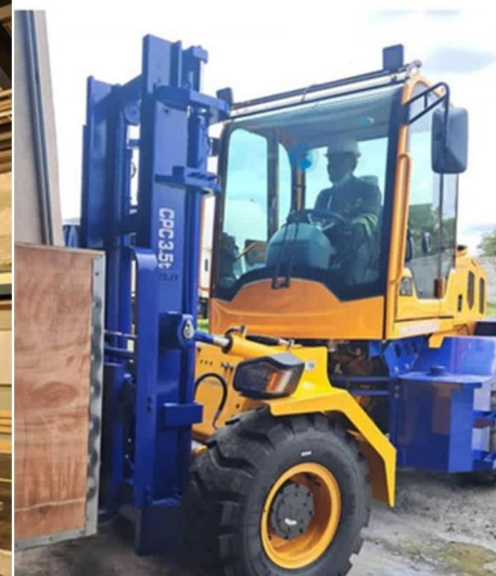
TP60 FILTER BEING ASSEMBLED IN FINLAND FOR OUR CLIENT IN ZAMBIA UNDER CURRENT PROJECT