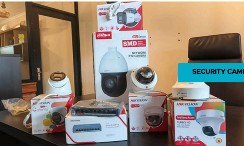
SECURITY CAMERAS ON DISPLAY

Trigen Investments Company Limited offers security and communication technologies. It specializes in CCTV, telephone systems, access control, electrical work, and general construction for commercial, industrial, and residential clients.