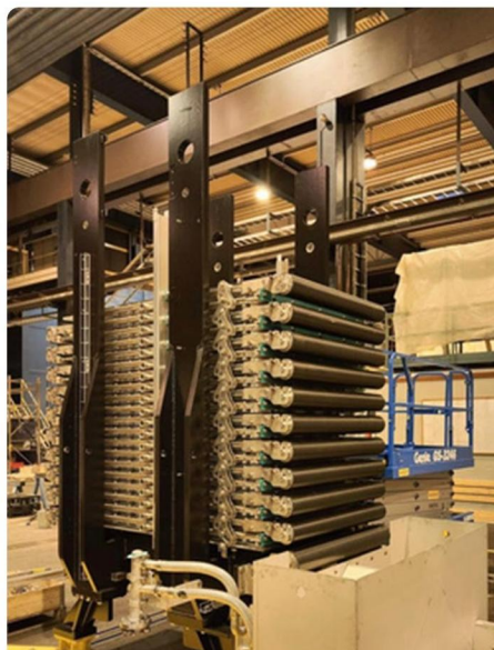
OFFLOADING OF CHEMICALS AT THE WAREHOUSE

Within the mining industry, RGPM collaborates with leading technology experts to deliver high-efficiency filtration systems — such as ceramic disk filters, smart filter presses, tower filter presses, and precision components — to optimise mineral processing operations.