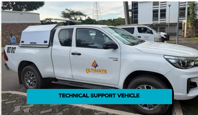
TECHNICAL SUPPORT VEHICLE